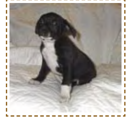
Wilson as a pup!

My husband and I adopted Wilson back in March of this year. He is doing very well and loves his big sister Tela (a lab mix) very much! He is doing fairly well with his "lessons" but once in a while he, lets just say, loses focus. He loves the fact that we are caterers because he has an endless supply of delicious treats. He loves to help us in the garden as well. In particular he enjoys picking and of course eating the raspberries, gooseberries, zucchini, basil, etc. Because Wilson is a little bit lazy, we have him on a forced march every evening which couldn't make Tela any happier. Despite the size difference, he can usually beat her home. He is starting to enjoy the water as well, especially chasing the tadpoles. We are very happy that Wilson found his way to us. His happy, playful, snuggly disposition have made him a very special part of our home.