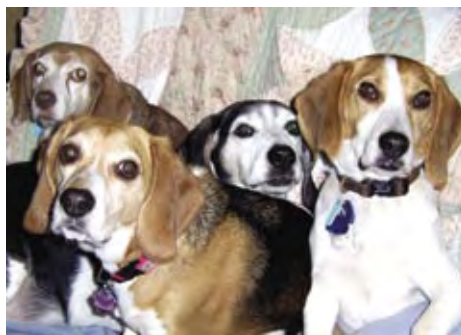
Stella, Rip, Ginger and Jaggar

I live with 3 other beagles, all rescues. There is Rip, 14, and Ginger, 9, both former Humane Society residents, and Jaggar, 4, a stray who is my partner in crime. I also have 3 Collie siblings who were also all rescues. We all get along very well and I am very much loved. I just wanted to let you know I am happy, healthy and doing great. I am sending a picture of me and my beagle brothers and sister for you to see. Take care and give all my beagle friends in rescue a big hug and kiss from me.